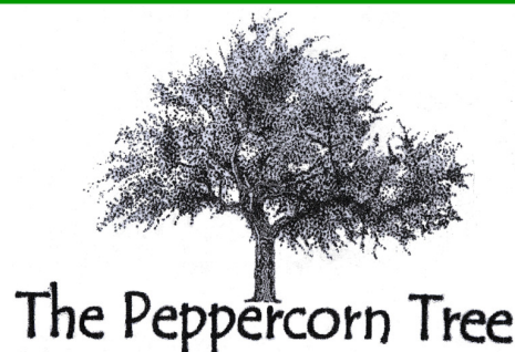
The Peppercorn Tree

The performance season runs over six performances from 23 to 31 October. Watch www.famda.org.au for more details and booking information.