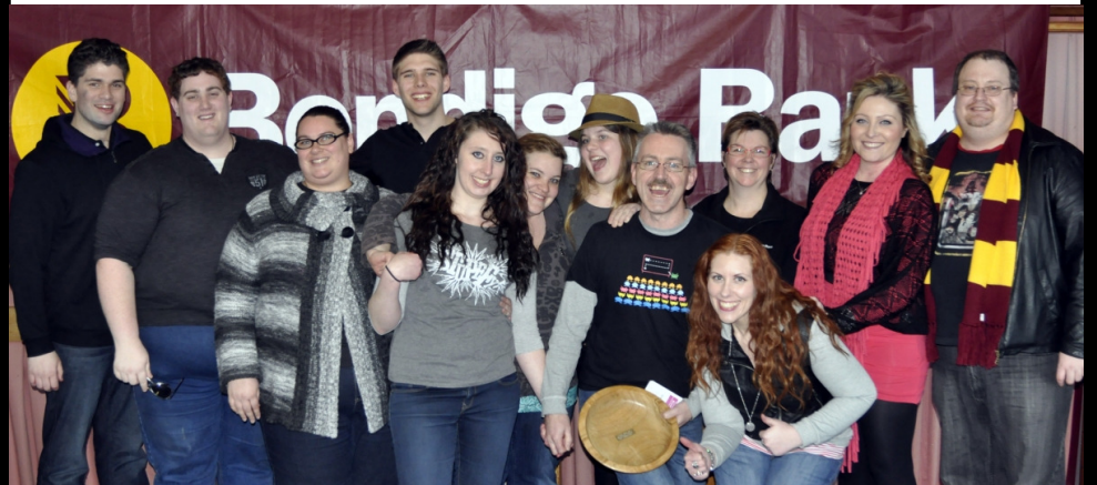
The happy crew from Pop Culture Theatre, winners of the 2011 Bruce Crowl Award for their slick and hilarious staging of 'The Seven Deadly Sins'.